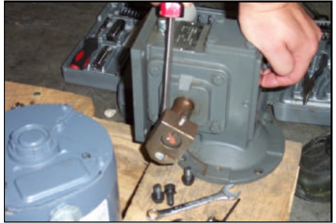
Removing the drive hub.

25. Set the gear reducer on a flat surface. The drive hub needs to be removed. You have already loosened the set screw, but it may take some more effort to remove it. You may pry it off, or give it some taps with a mallet to coax it off of the shaft. The liberal use of spray lubricants will also help.